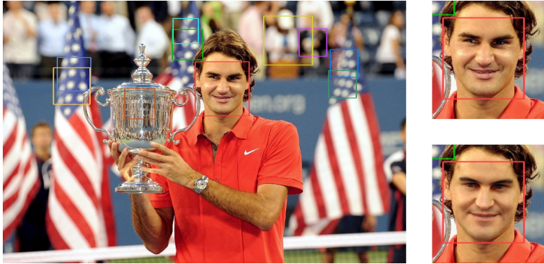
Fig. 2: Original image with unreliable face detections (boxes), on the right: face region selected by the algorithm as original (top) and final face reconstruction result (lower)